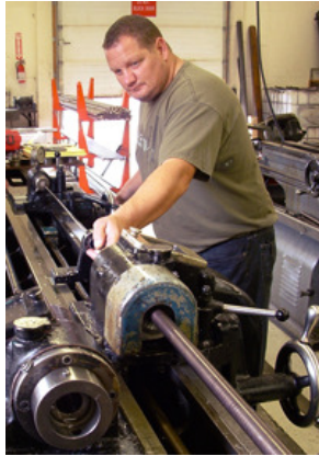
A McGowen machinist guides a drill on a manual lathe.